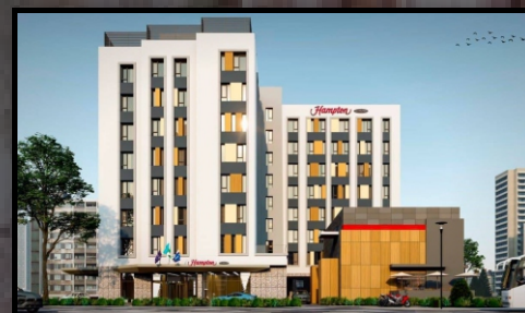
Team Hotel #2 Hampton by Hilton Tashkent Capacity: 255 people