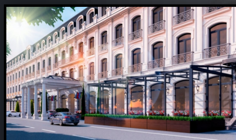
Head Hotel # 1 Lumiere Hotel & SPA Capacity : 200 people

Extra officials can stay with team delegations