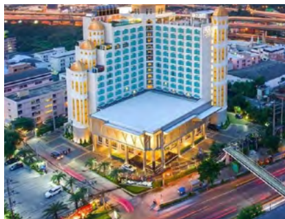
Al Meroz Bangkok (Halal hotel) www.almerozhotel.com