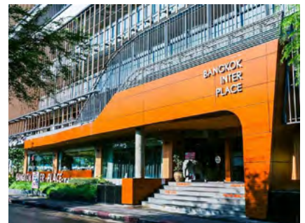
Bangkok Inter Place bangkokinterplace.com

The Alexander Hotel will serve as the main team hotel and will host: